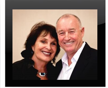
40 Years of Victory

Missions International Head Office Box 65077 RPO North Hill Calgary, Alberta T2N 4T6 P: 403-286-8337 | F: 403-286-8335 missions@victoryint.org